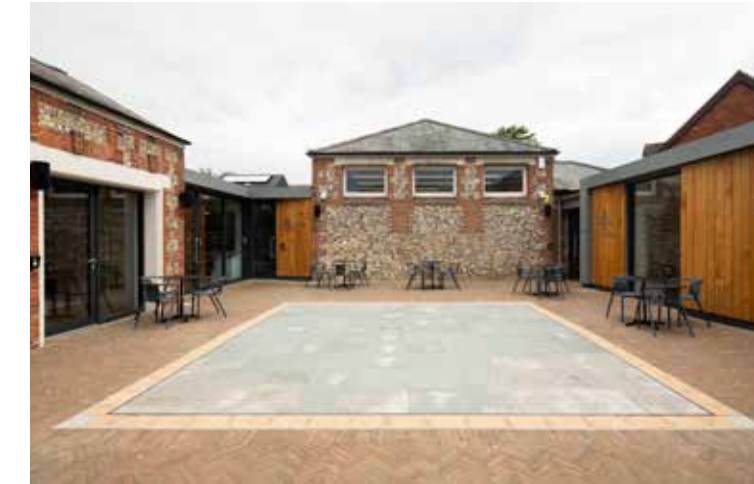
The Courtyard.

For further information, please contact hospitality@petersfieldmuseum.co.uk or call 01730 262601