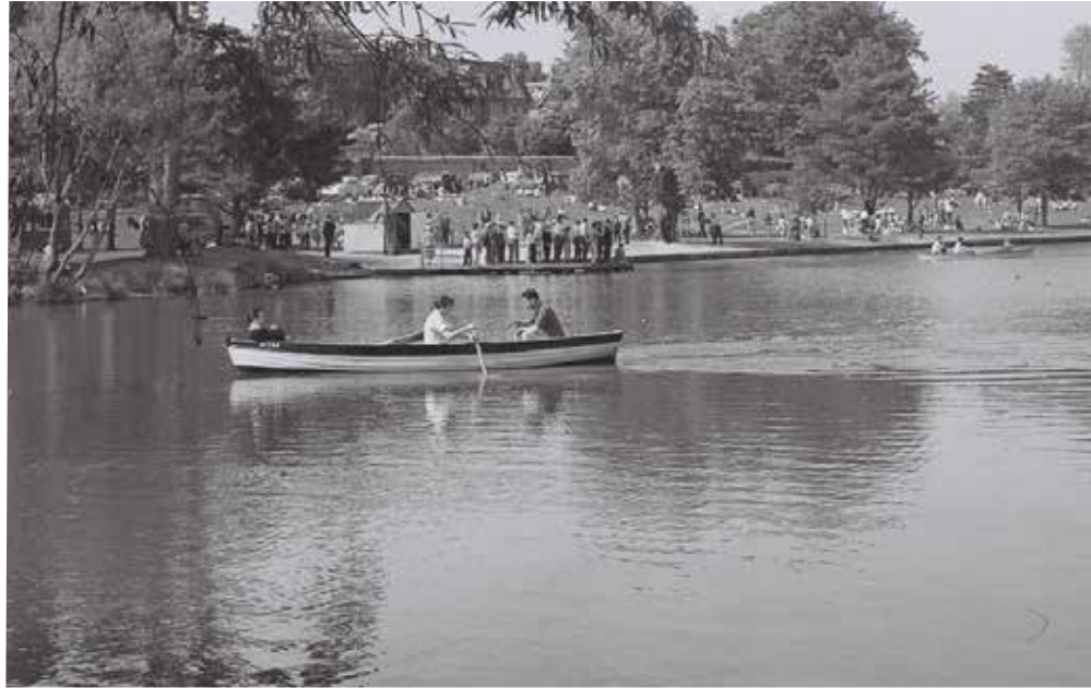
© Petersfield Museum and Art Gallery