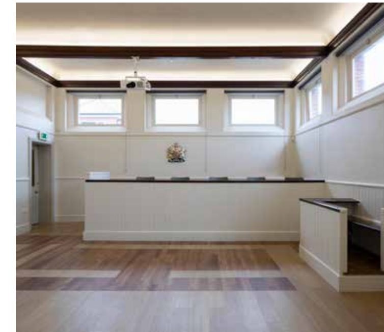
The Courtroom.