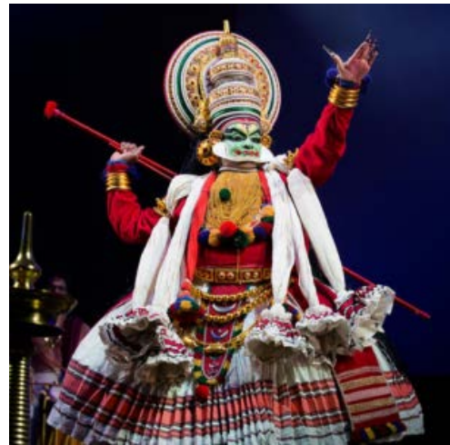
THE KALA CHETHENA KATHAKALI COMPANY